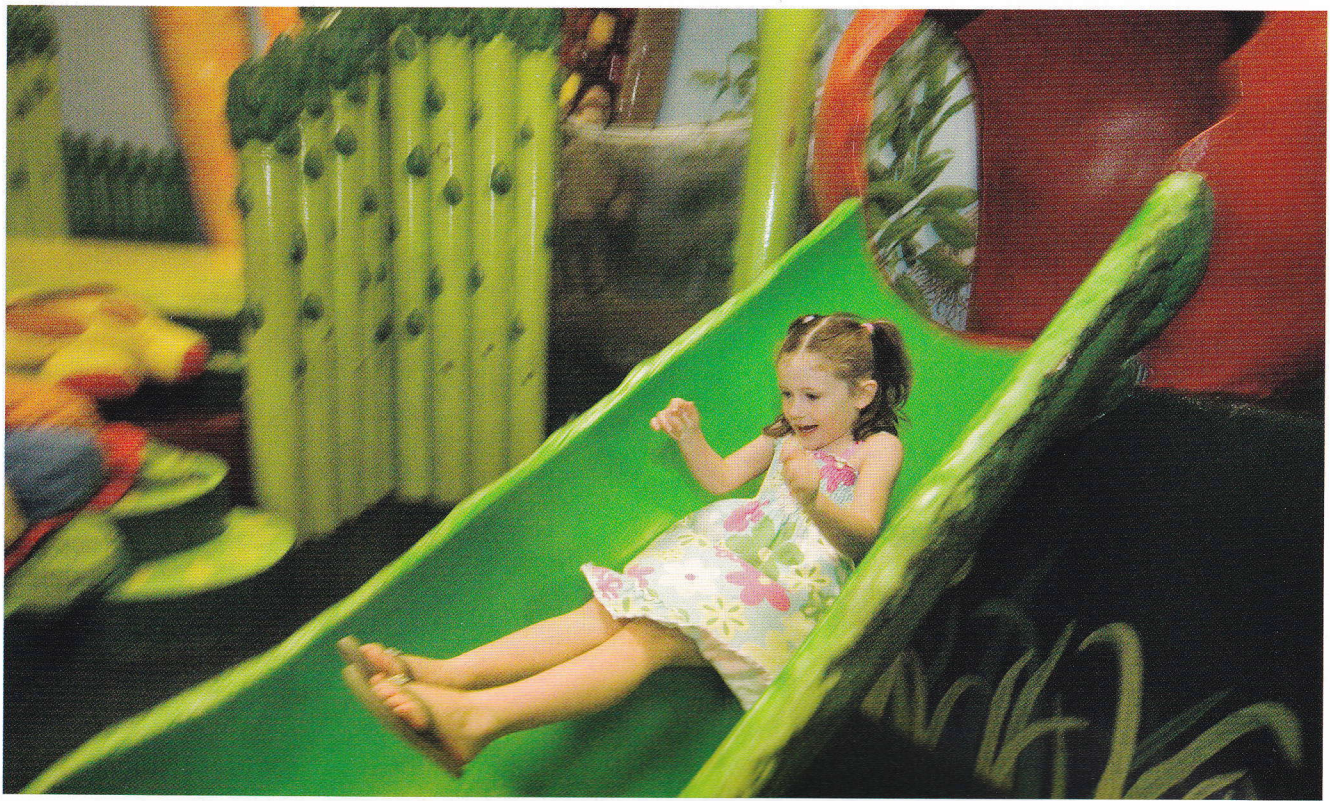
Young children will enjoy the whimsical Happy Baby Garden exhibit at The Building for Kids in Appleton.

One of Madison Children's Museum's most popular exhibits is the Gerbil "Wheel," a human-sized version of a gerbil wheel. It's also a hit with adults during the museum's quarterly Adult Swim events, where an adults-only crowd can explore for an evening. Possibilities