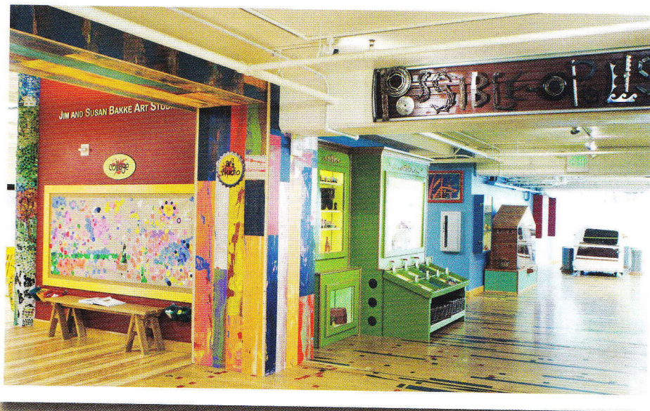
The Possibleopolis exhibit at the Madison Children's Museum offers an interactive environment celebrating creativity and invention.