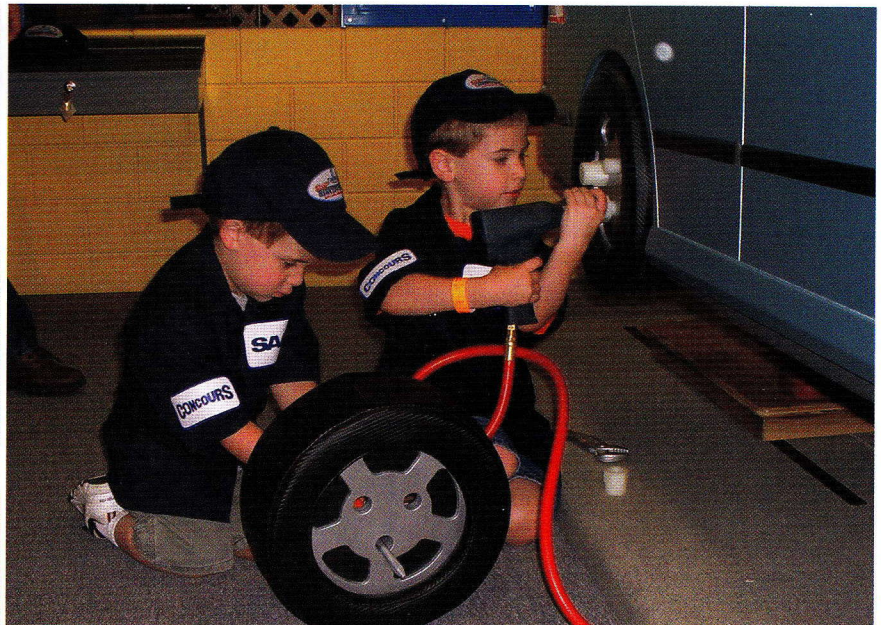
LEFT: Kids explore the variety of activities at Betty Brinn. RIGHT: Rotating tires and auto maintenance are just some of the activities children will enjoy at the Super Service Center in the Home Town exhibit at the Betty Brinn.

version, where scanners beep, purchases are made, and cars are washed. The nearby town exhibit features a hospital, grocery store and pet shop, giving children the experience of a realistic work setting. Learning is fun in the DaVinci Studio, an extensive art and science center where kids can participate in (sometimes messy) hands-on science and arts-related activities (aprons provided). The Move-It exhibit features levers, tubes and baskets that allow kids to learn basic engineering concepts.